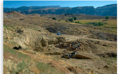
Howe Ranch, Big Horn Mountains Behind

Healed injuries of BIG AL TWO point to the rough life of this Jurassic theropod. The skull has extremely large lachrymal horns, much larger in proportion to its skull than any other species of Allosaurus . This specimen is a small, yet fully grown adult, preserved with possible evidence of its last meal (a small herbivorous dinosaur ischium, a lungfish tooth, a gastrolith, and some bone fragments).