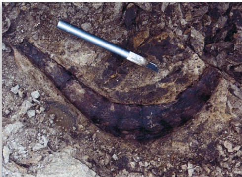
A furcula (wishbone) was found with BUCKY!

BUCKY has a nearly complete vertebral column to the end of the pelvis, the third most complete tail of any T. rex known and an excellent rib cage complete with gastralia basket (belly ribs). The addition of the gastralia basket enhances the visual perception of the dinosaur, as it better outlines the shape of the body. The skull is a scientific reconstruction which utilized modified casts of DUFFY (another subadult T. rex ) and other T. rex specimens.